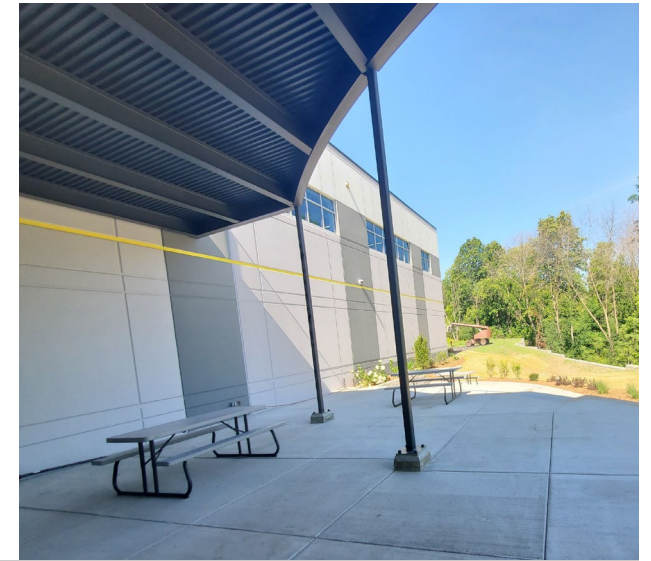
Outdoor Patio Meeting Areas