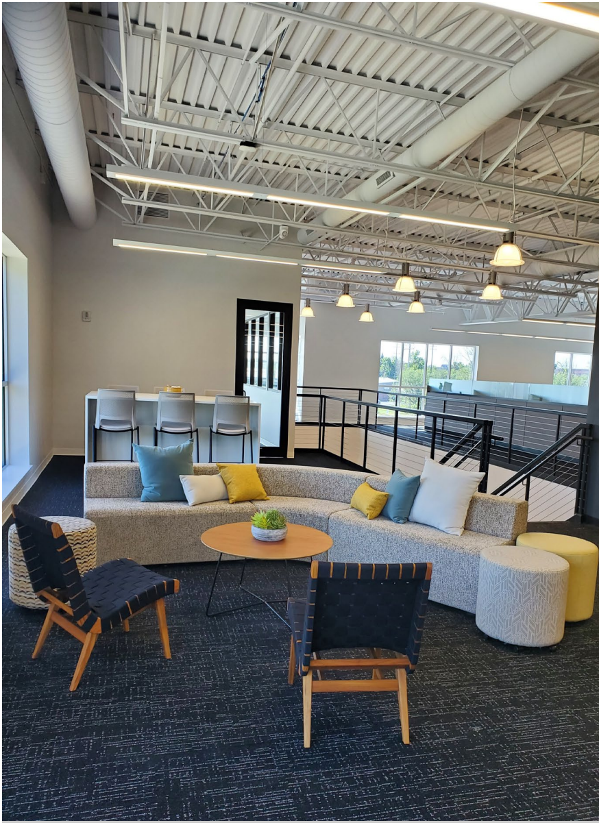
Indoor Seating for Idea Generation