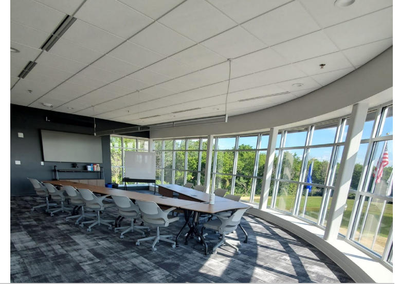
Conference Rooms with Natural Light