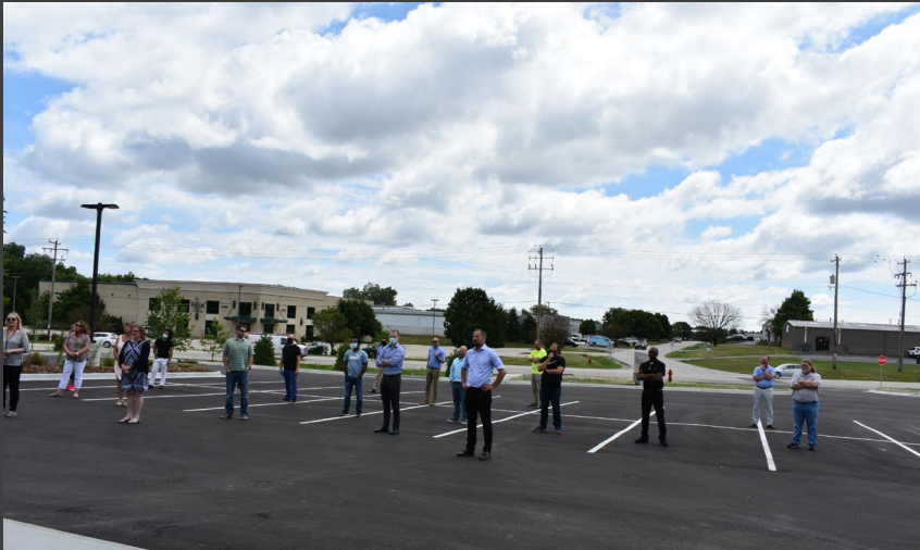
Angelus Corporation Staff